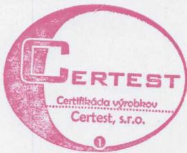
Certification Body Stamp

Restraint / stipulation of the product usage: ---